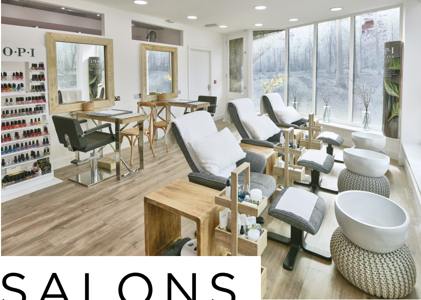
TOWN SPA SALON & STUDIO